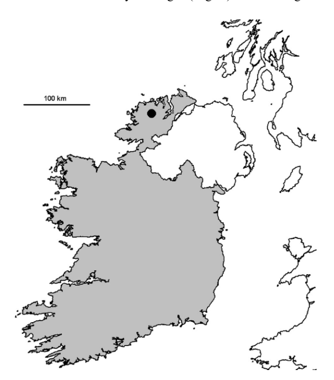
Fig. 2. The Republic of Ireland (shaded gray) with the release site (Glenveagh National Park) marked by a filled circle.

The Glenveagh National Park in the Derryveagh Mountains of County Donegal (Fig. 2) had the highest